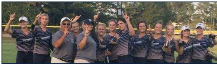
The Varsity softball team defeated Southland to clinch the Region Championship!