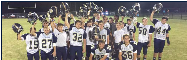
The Junior Varsity football team finished their season undefeated by taking down Deerfield 13-0 to win the Region Championship!