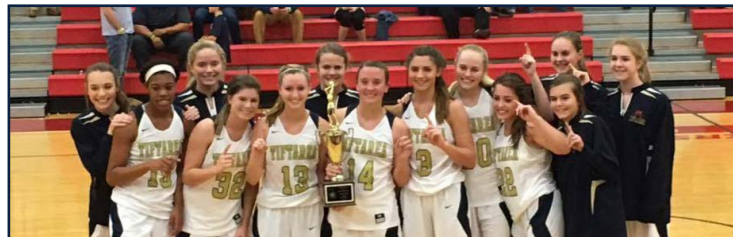
The Varsity Girl's basketball team are the Region 3-AAA champs after beating Southland in the semi-final and Brookwood in the final.